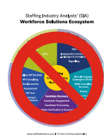
Source and copyright cropped